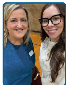
BITE OF REALITY VOLUNTEER AT BAY CITY CENTRAL