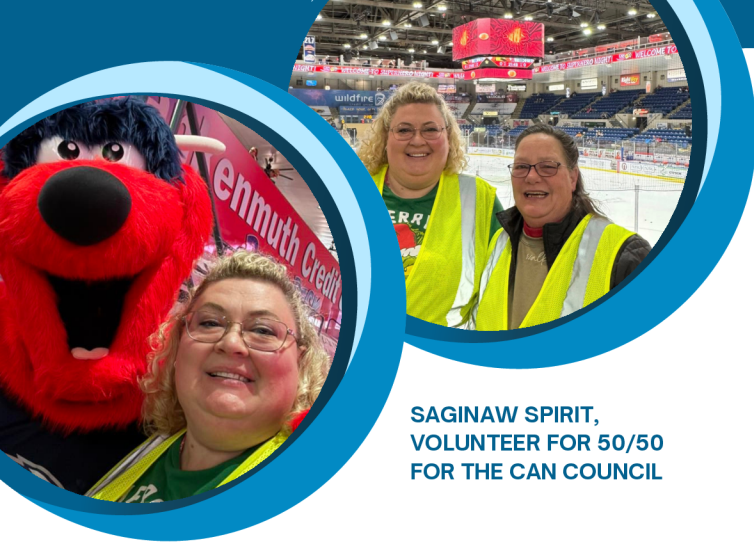
SAGINAW SPIRIT, VOLUNTEER FOR 50/50 FOR THE CAN COUNCIL