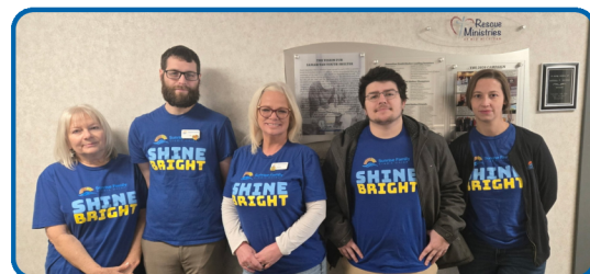
GOOD SAMARITAN RESCUE MISSION SERVING MEALS